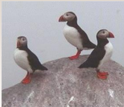
Our Puffins– Friendship, Loyalty, and Education